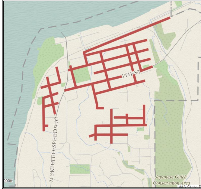
Streets in North Mukilteo expected to receive crack-sealing treatment.