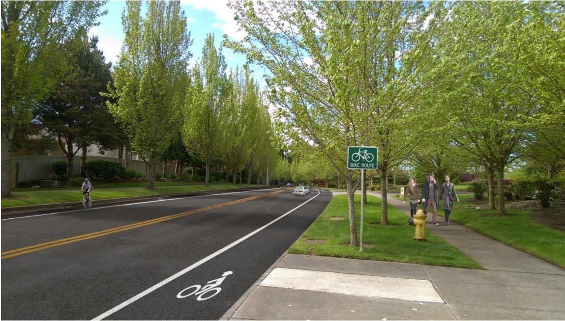
Conceptual Harbour Reach Drive