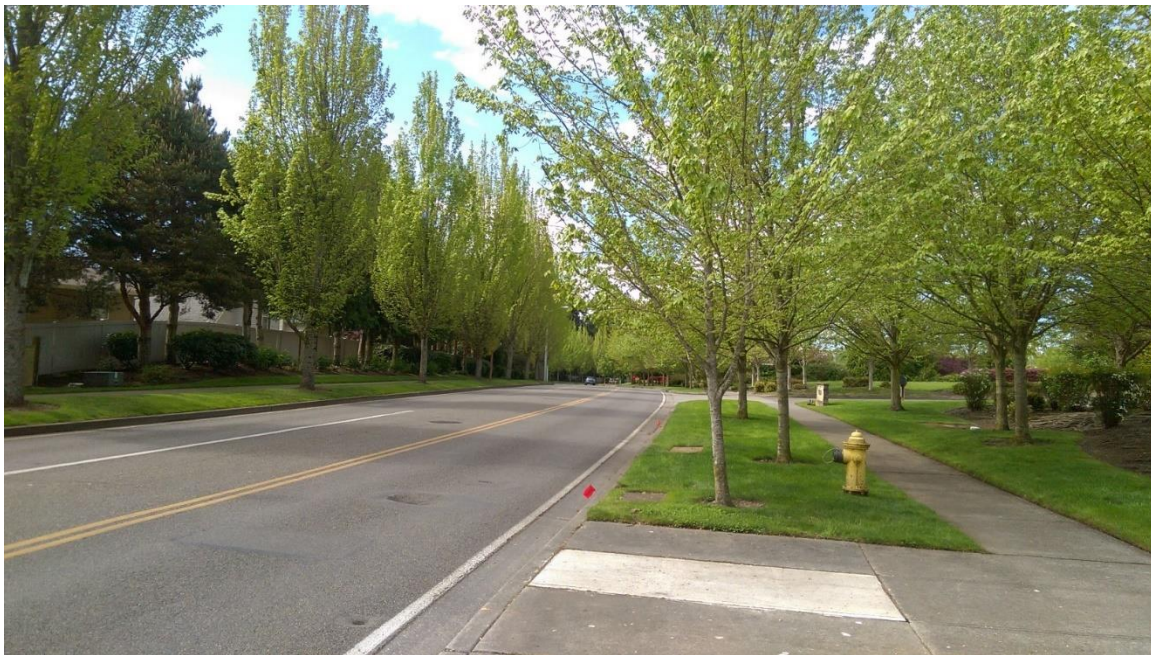
Existing Harbour Reach Drive

These planned improvements complement the Harbour Reach Corridor project currently under construction. The corridor project creates a completed north-south link between Beverly Park Road and Harbour Pointe Blvd. SW.