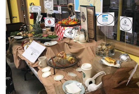
The "Stick in the Muk" entry at Accoutrements/Archie McPhee's food competition, highlighting Mukilteo businesses, was impressive!