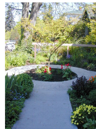
Beautification Project to Enhance Park Visitors

Only after both steps are completed is a project sponsor authorized to begin incurring reimbursable costs.