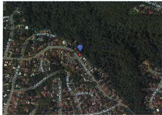
Central Drive near 103rd Place