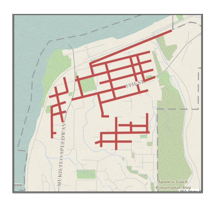
Streets in North Mukilteo expected to receive crack-sealing treatment.