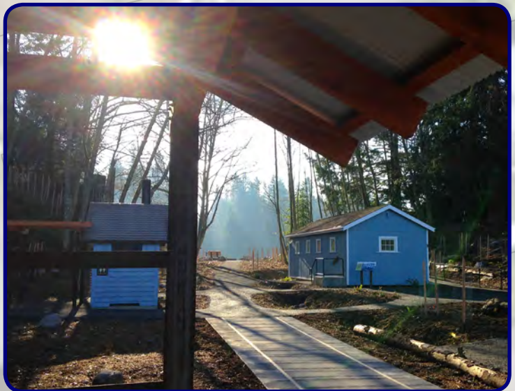
D. Historical Interpretive Elements