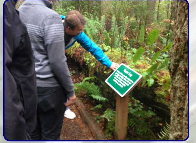
J. Nature Viewing Trail