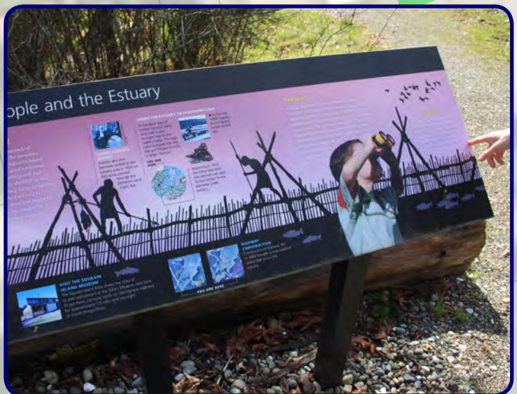
F. Ecological Interpretive Signs