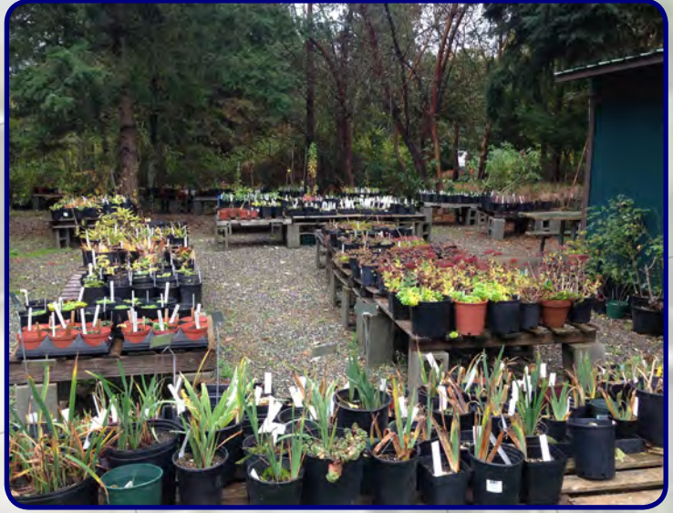
C. Native Plant Staging Area