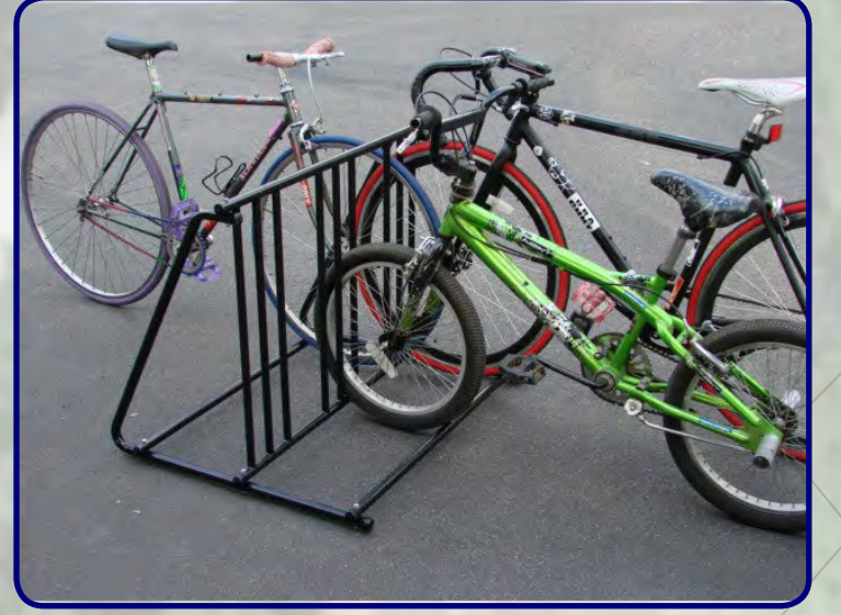
K. Bicycle Parking