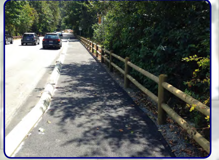
H. Roadside Trail