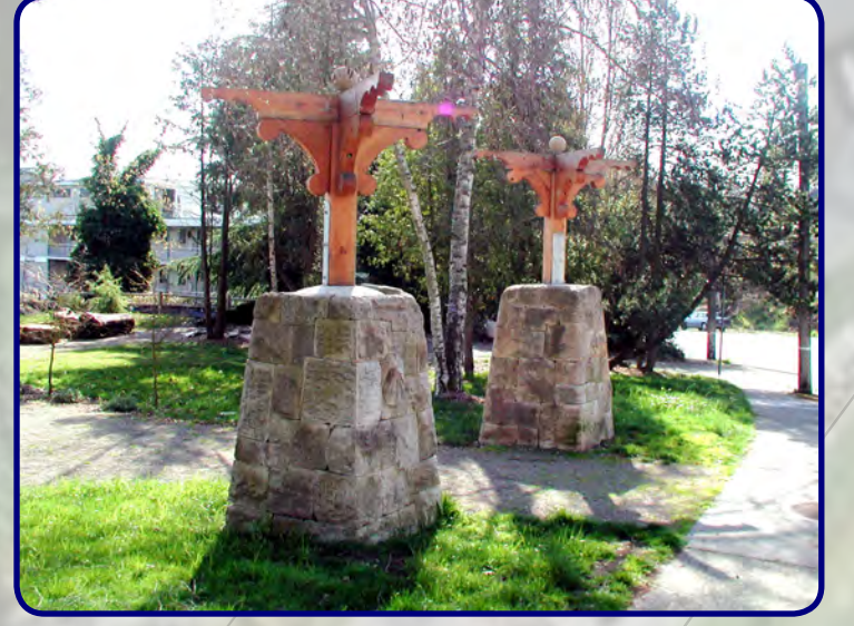
L. Artistic Gateway