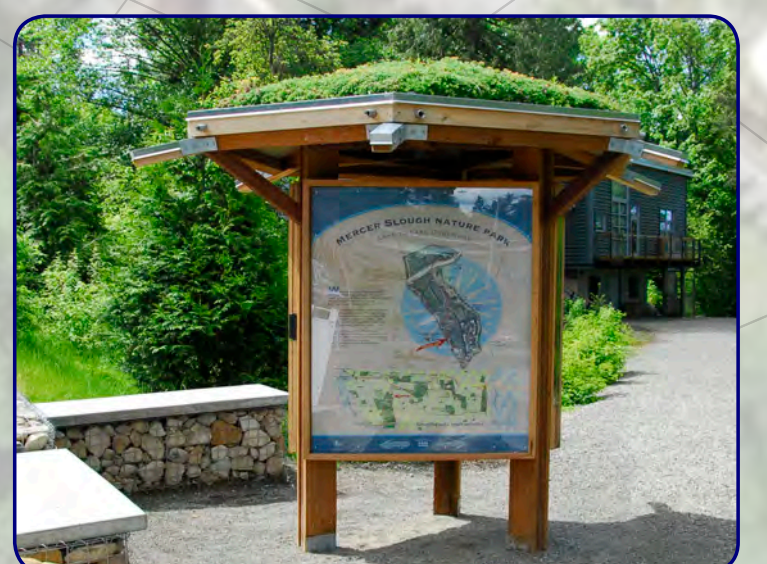
M. Trail Map/Kiosk