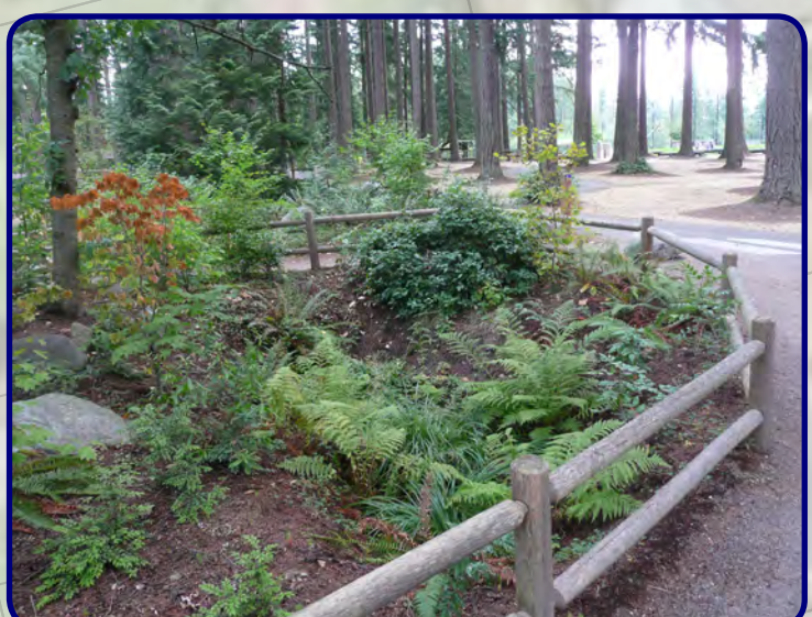
G. Bioswale/Improved Drainage