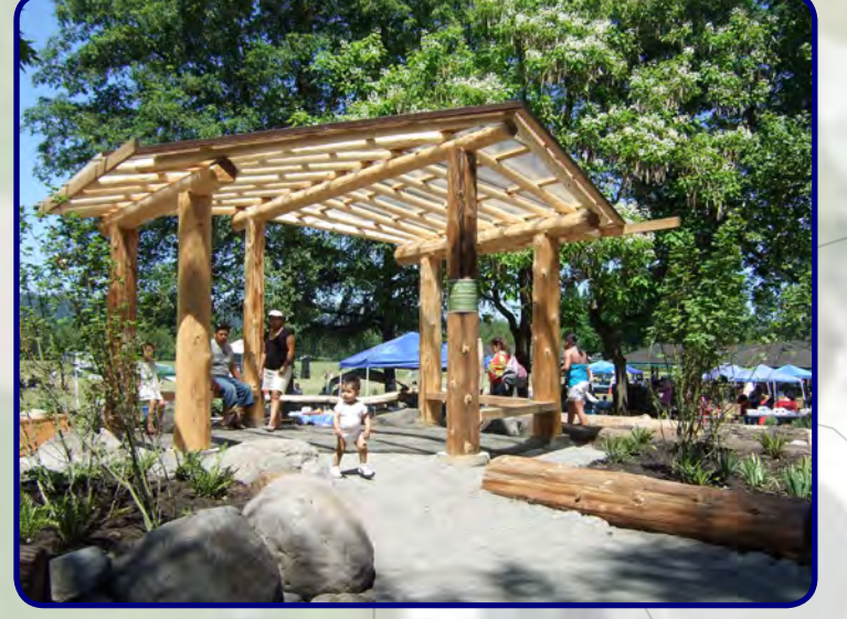
I. Picnic Area/Shelter