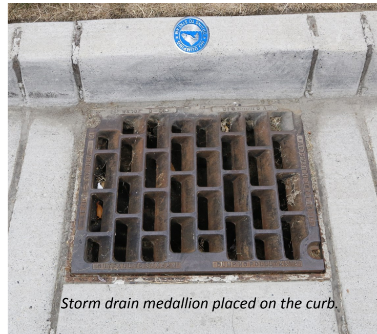
Storm drain medallion placed on the curb.

Medallions are a visual reminder that storm drains connect directly to streams and Puget Sound.